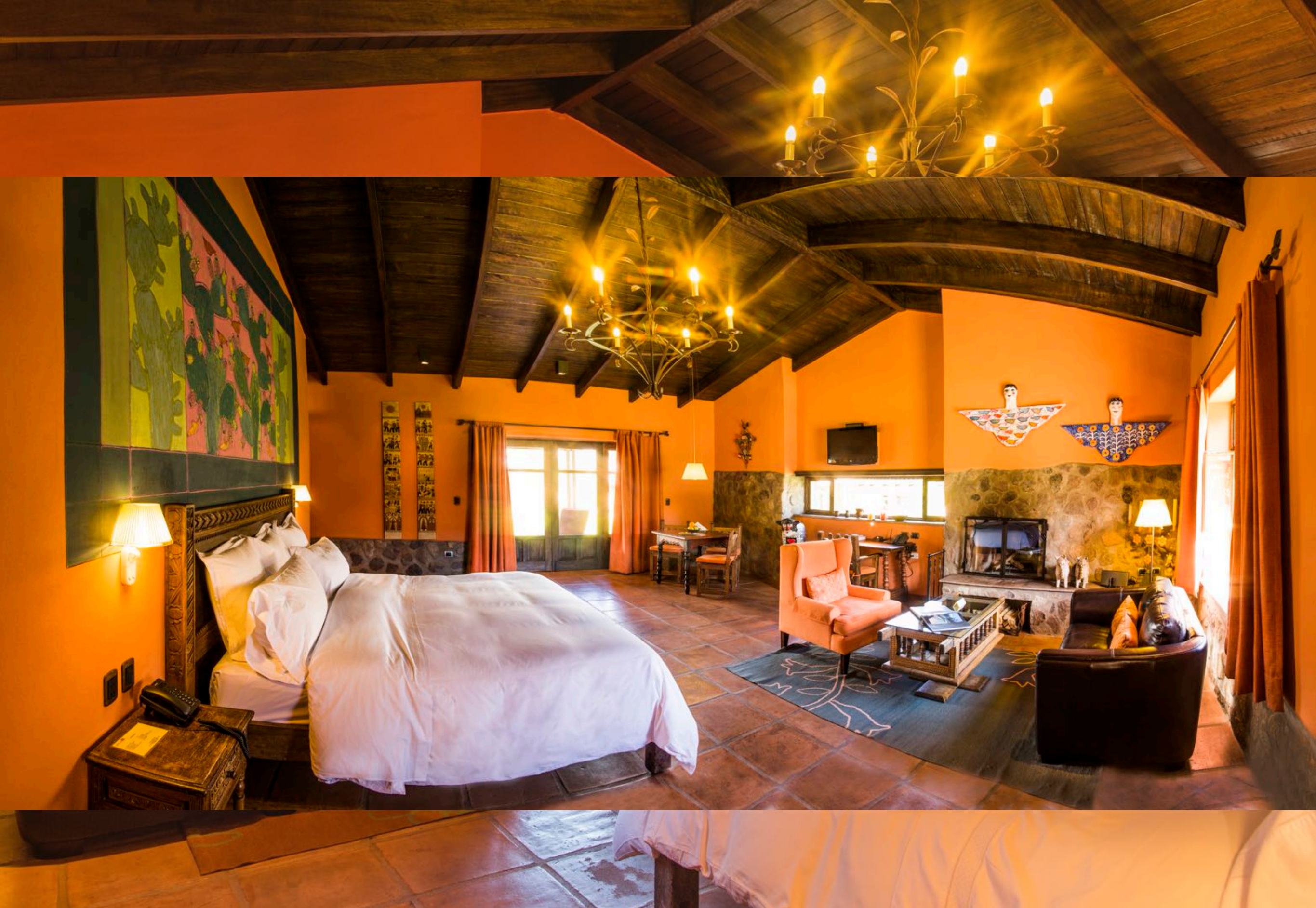
Sol y Luna – Casita Deluxe with a King size bed or 2 doubles beds ( some are connecting)