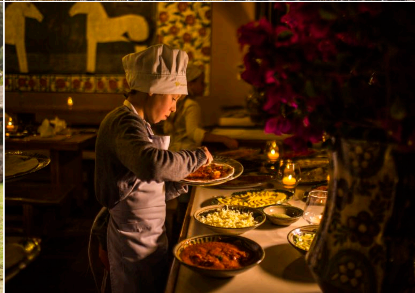
Sol y Luna – Activities include paragliding, mountain biking, horse riding and shows, pizza classes...