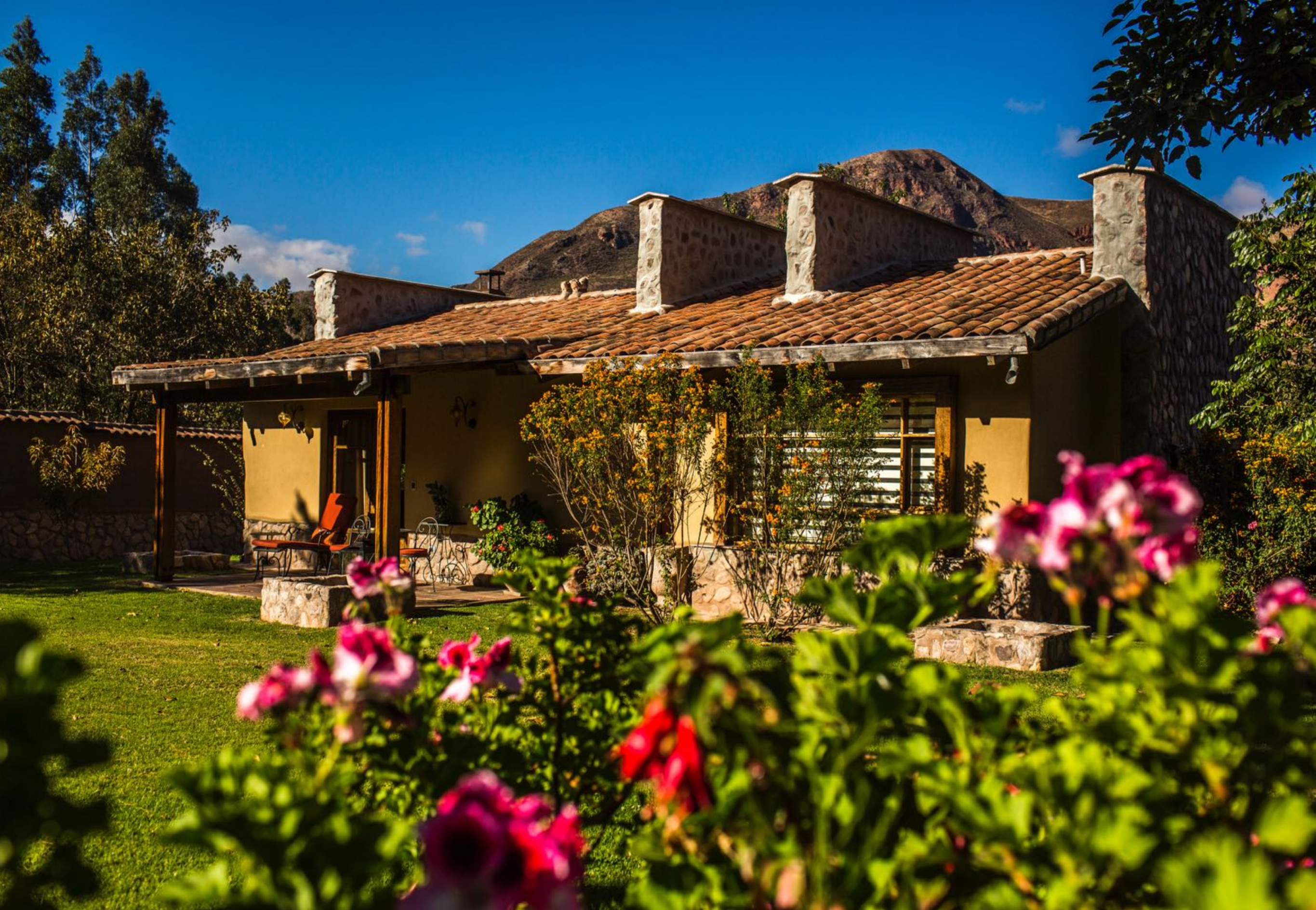
Sol y Luna – 10 Casitas Deluxe – 1,173 sq. Ft