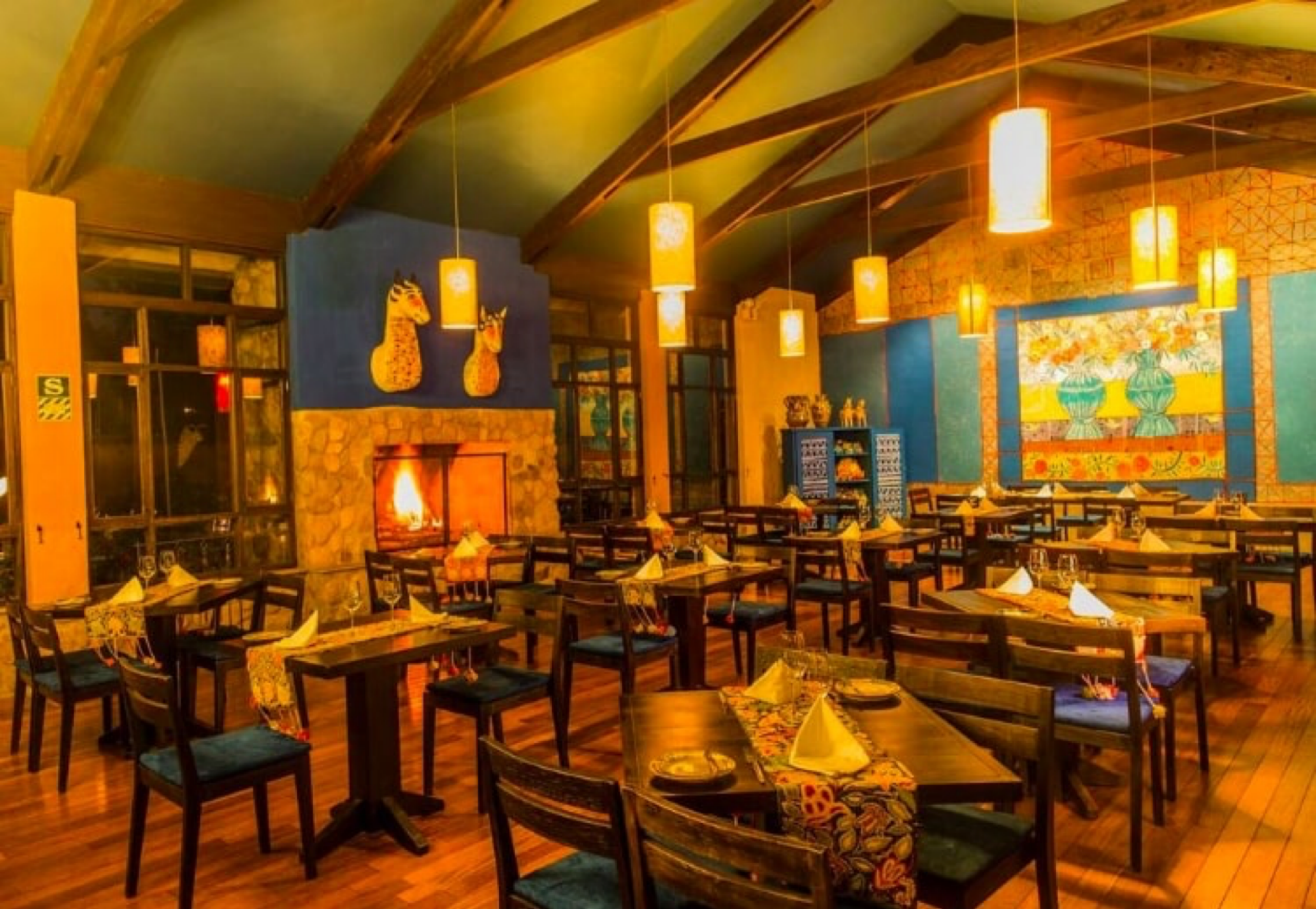
Sol y Luna – Wayra Restaurant with outdoor dining