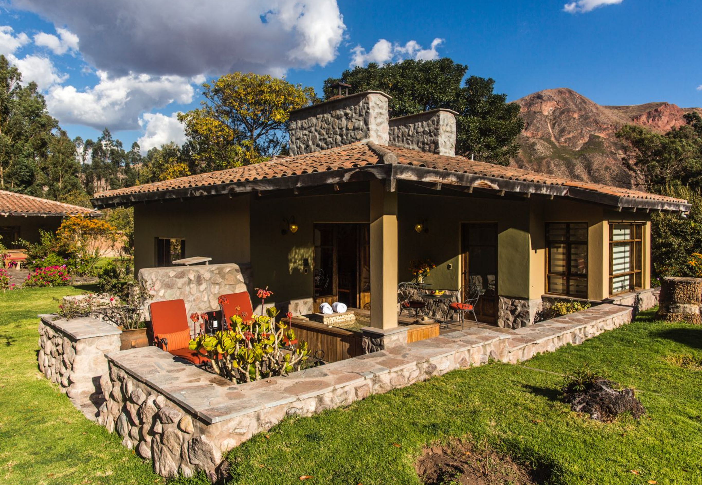
Sol y Luna – 5 Casitas Premium - 1,291 sq. ft with separate living room and outdoor jacuzzi.