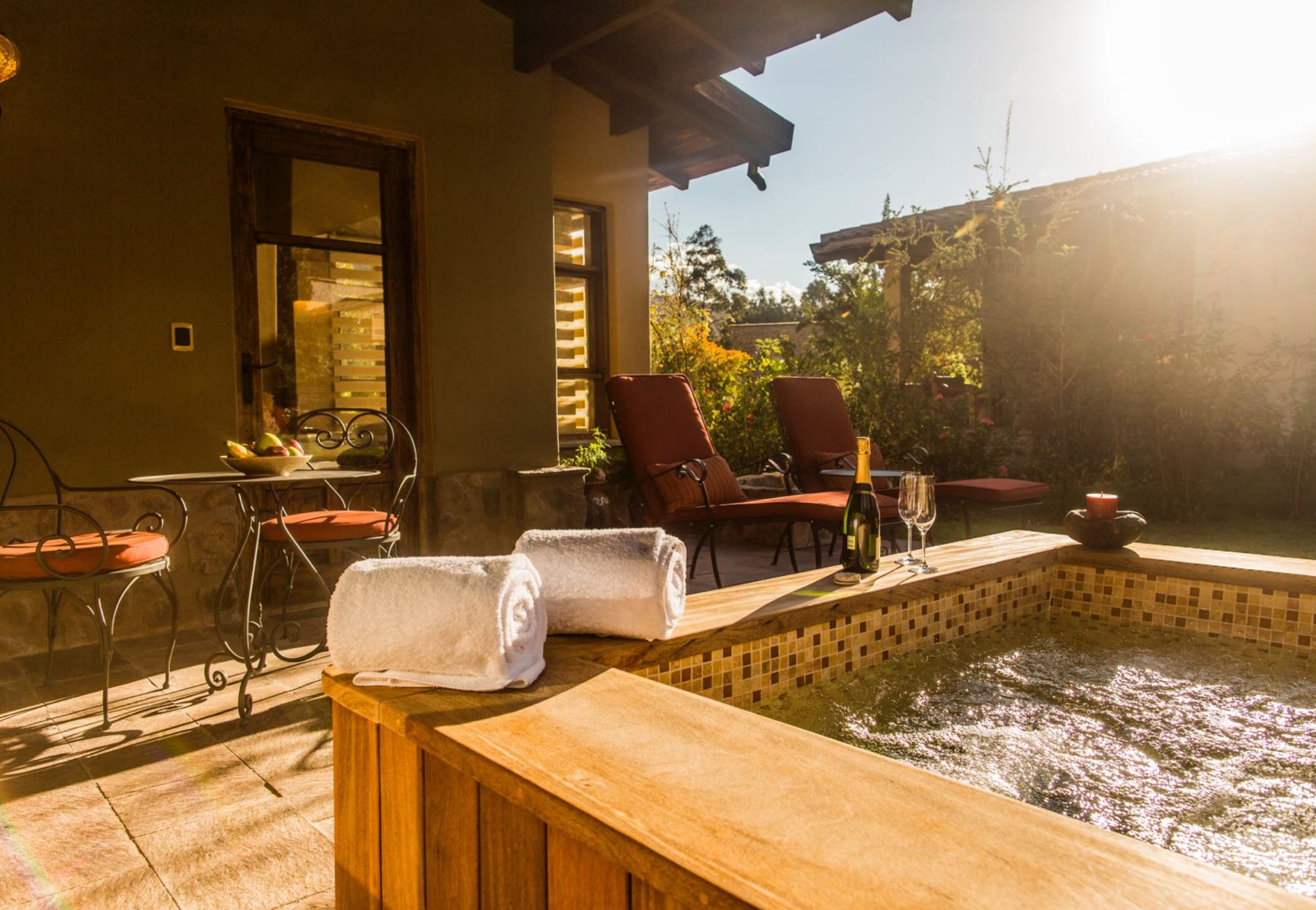
Sol y Luna – Casita Premium Terrace & Jacuzzi