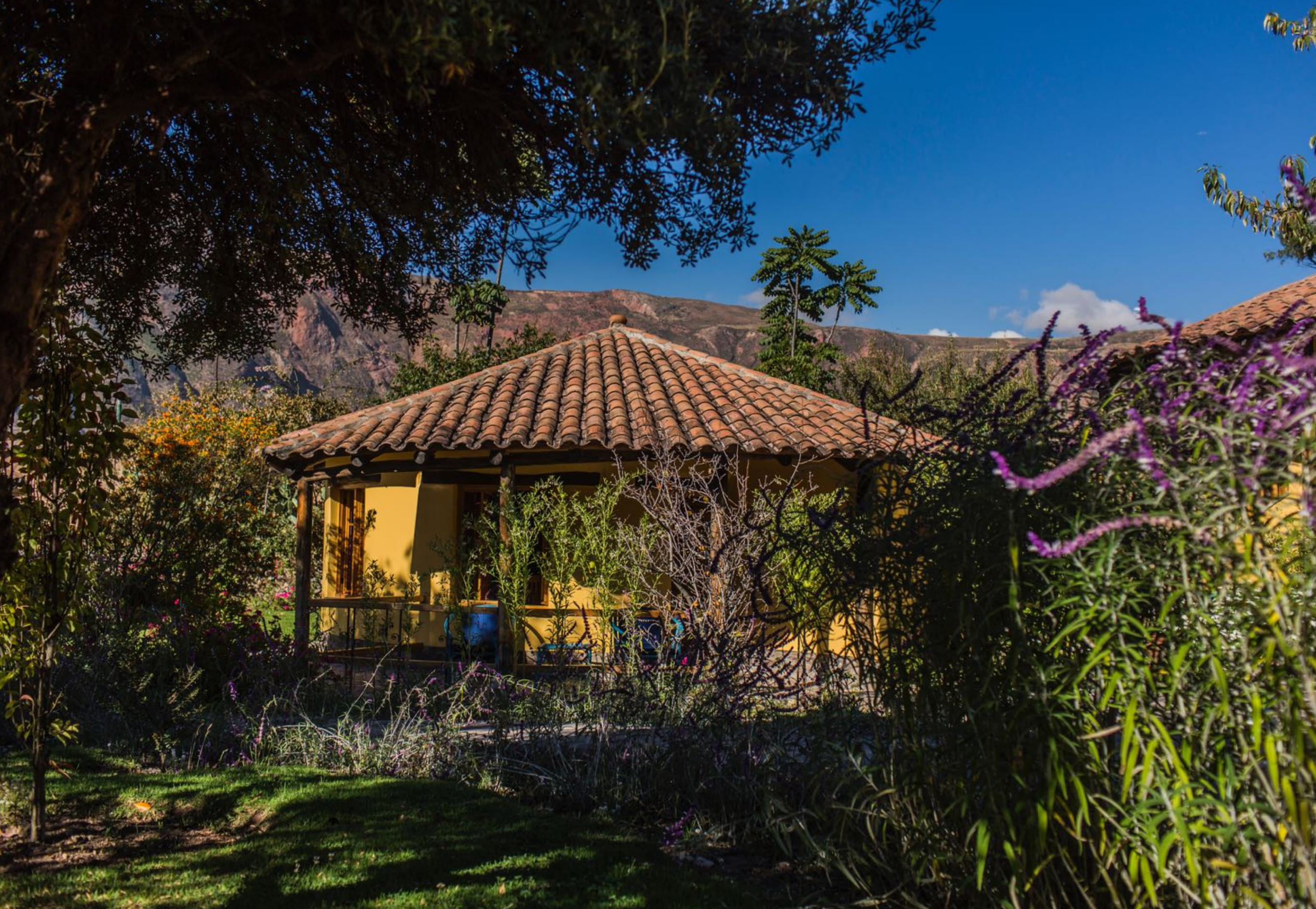
Sol y Luna – 28 Casitas Superior – 645 sq. ft.