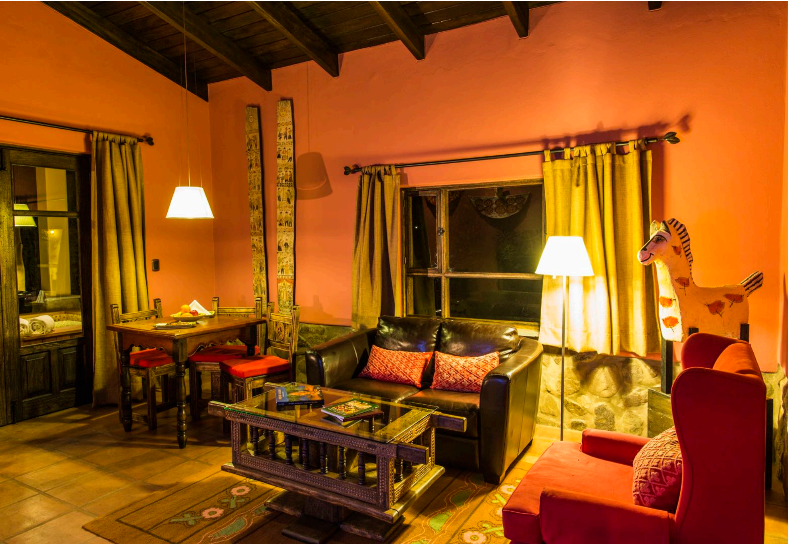
Sol y Luna – Casita Premium separate living room