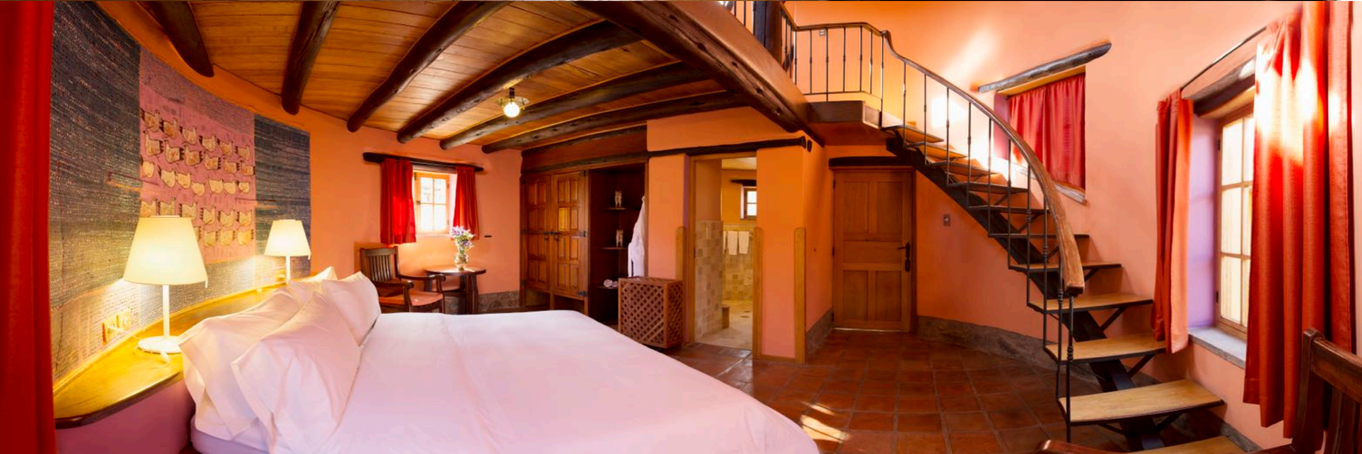
Sol y Luna – Casita Superior Familiar for up to 6 guests ( one king and 2 doubles beds )