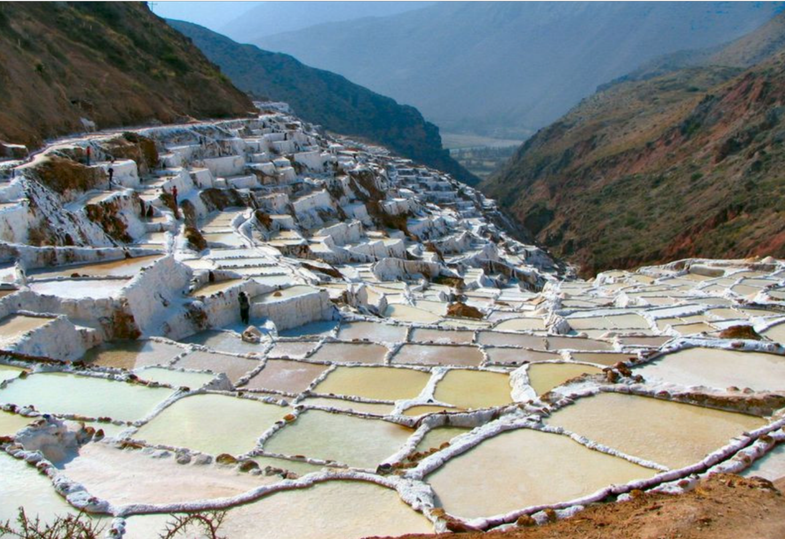
Sol y Luna – Excursion to Maras Salt Mines