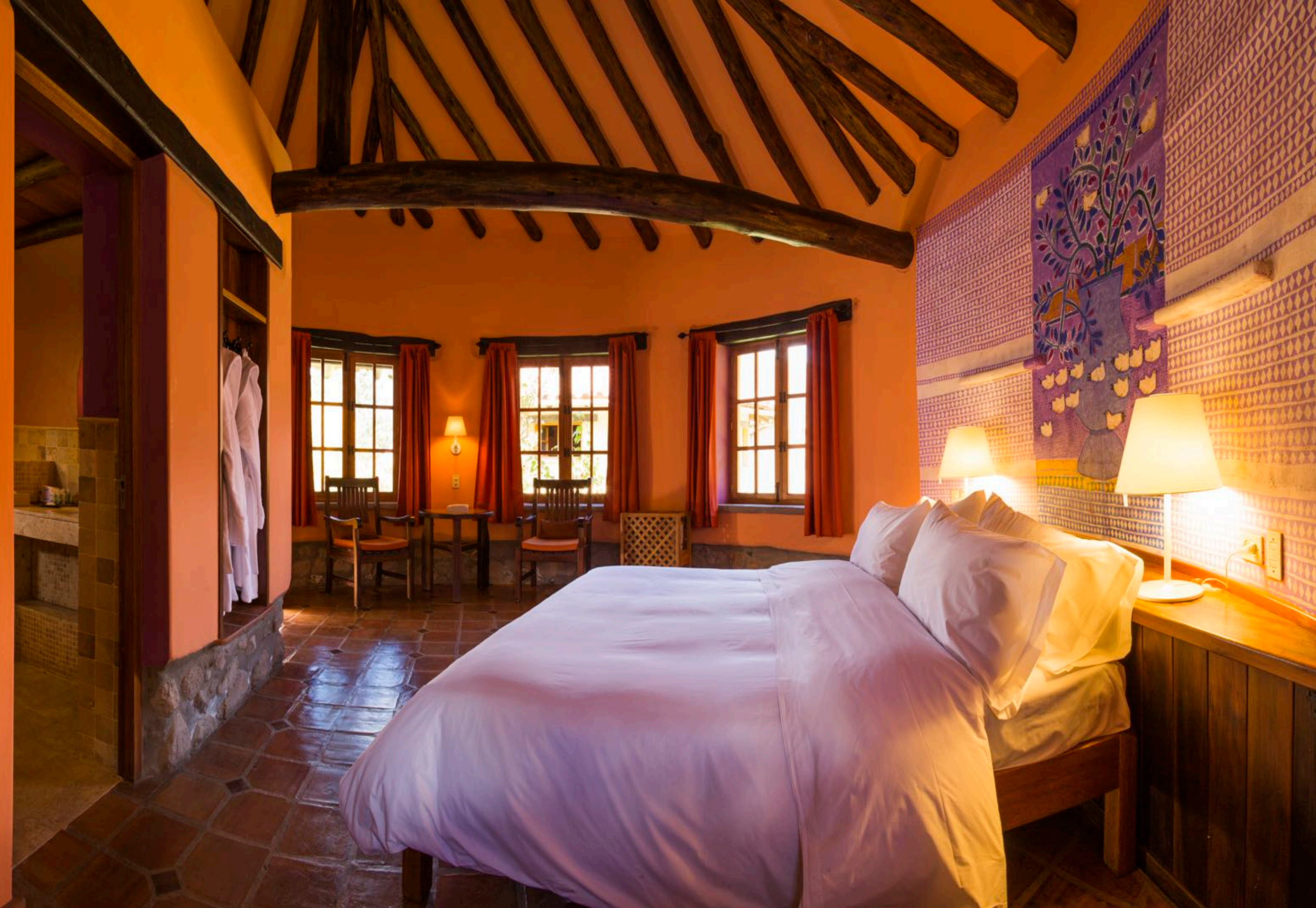
Sol y Luna – Casita Superior for 2 guests