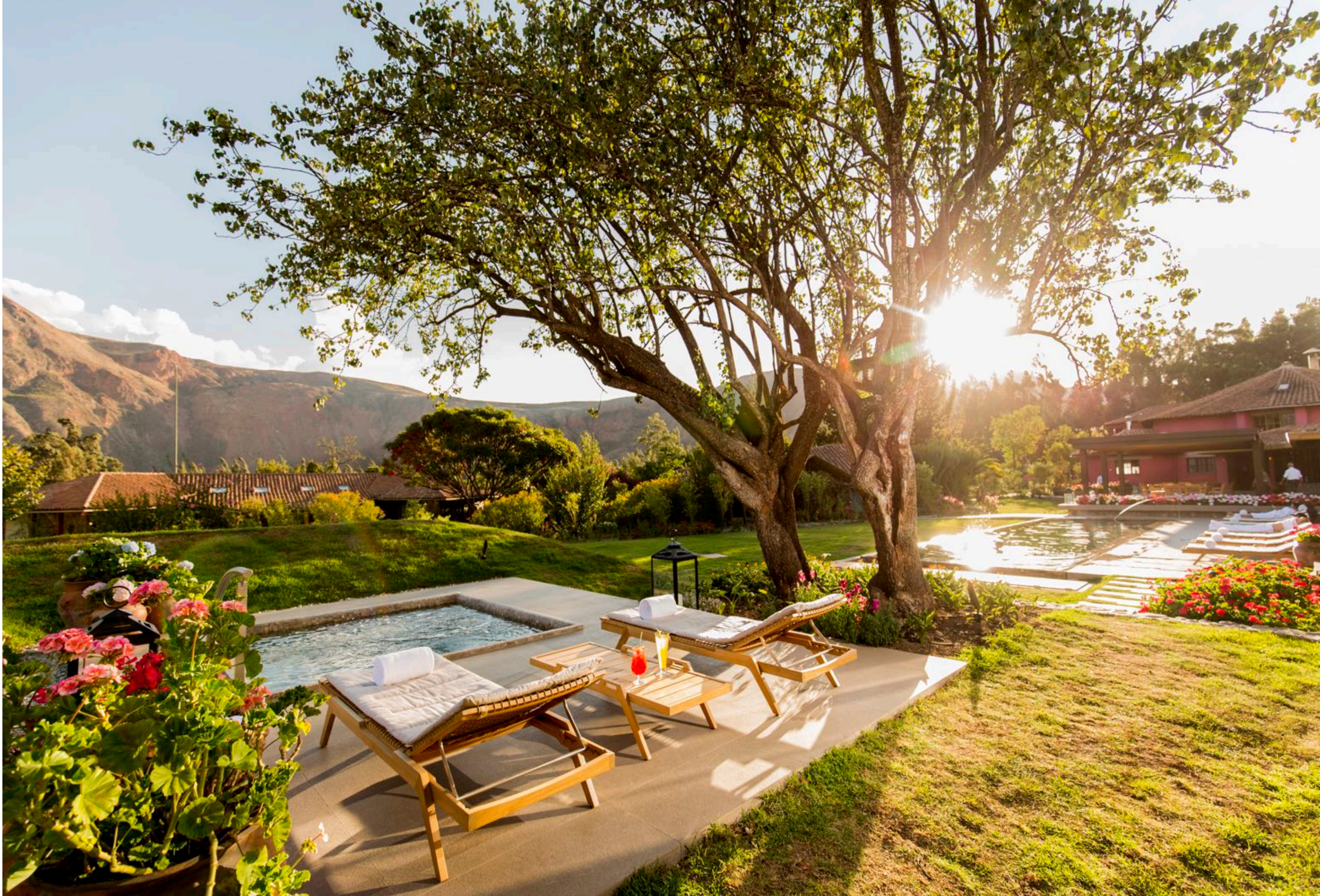
Sol y Luna - 43 Casitas ( Superior, Deluxe and Premium) some for up to 6 guests