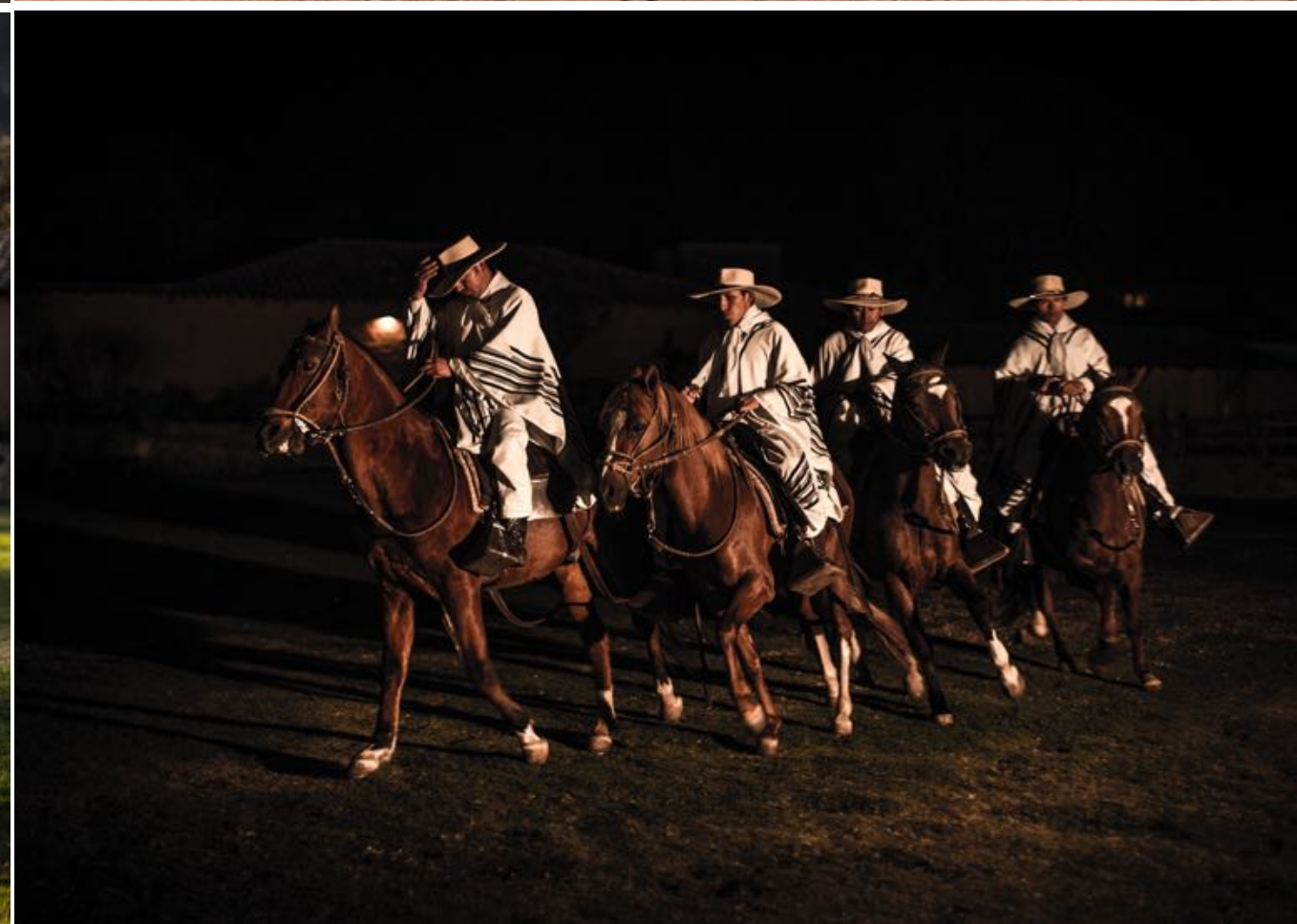
Sol y Luna – Kayaking, ATV riding, Horse shows, cultural immersions...