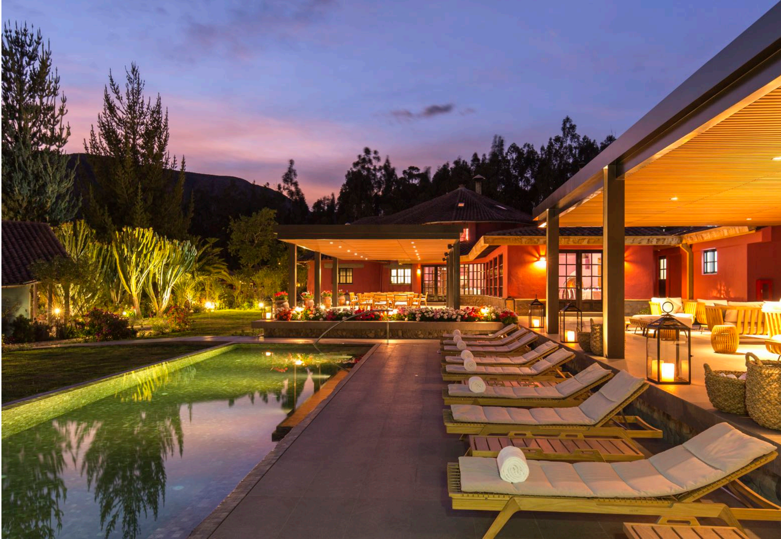
Sol y Luna – Heated pool and Jacuzzi