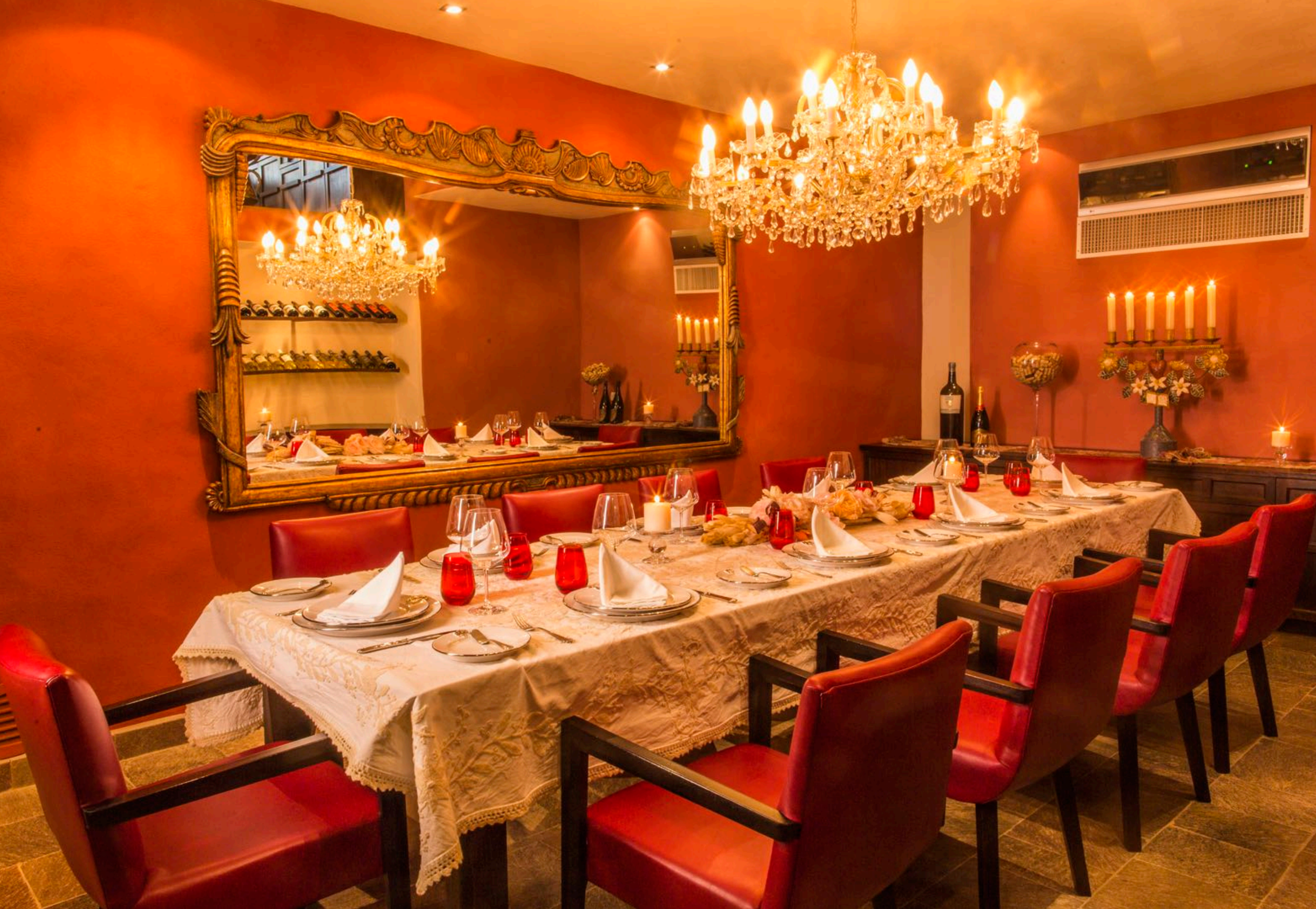
Sol y Luna –Cellar private dining