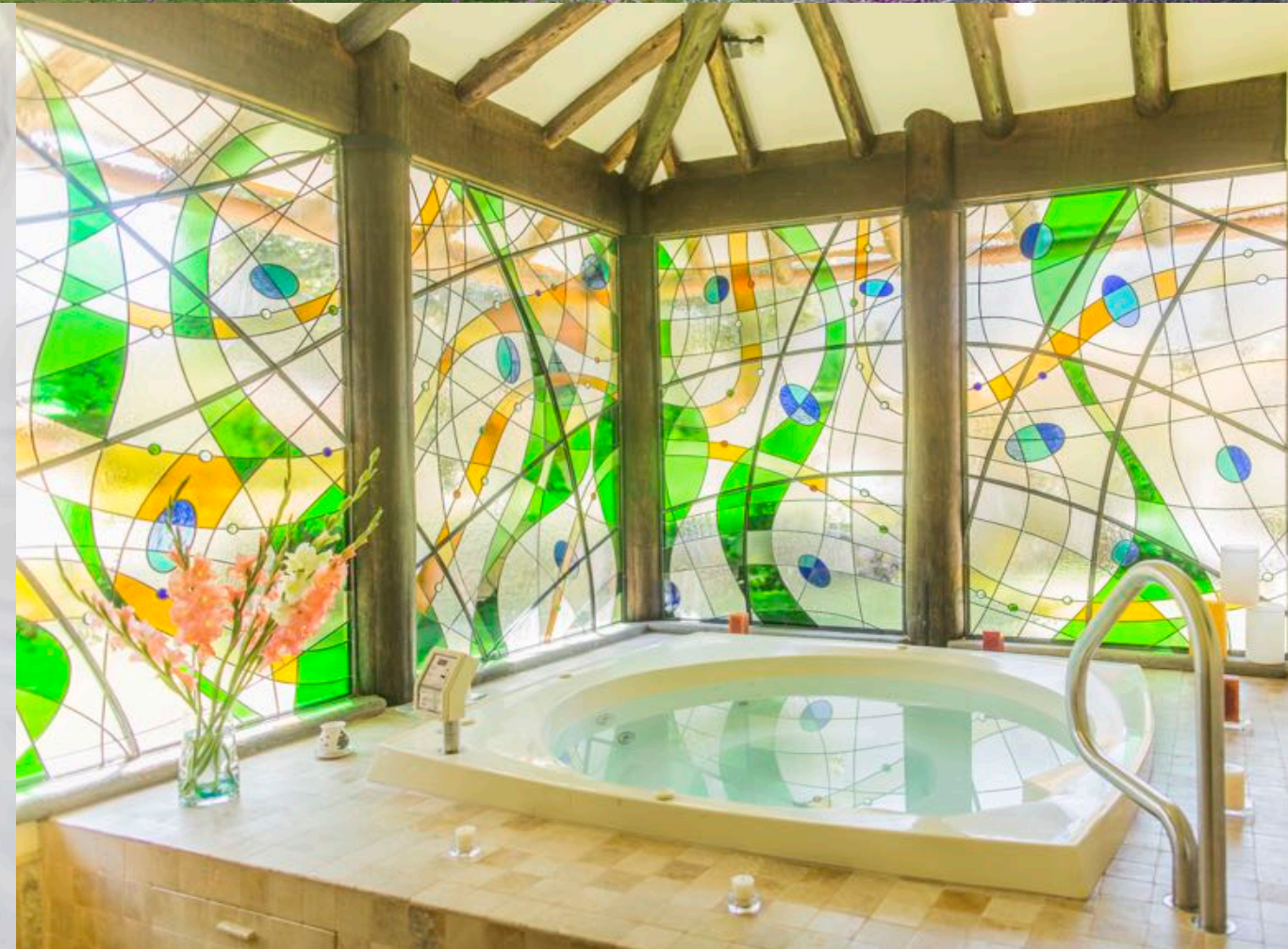
Sol y Luna – Yacuvasi Spa with Yoga, Sauna & Gym