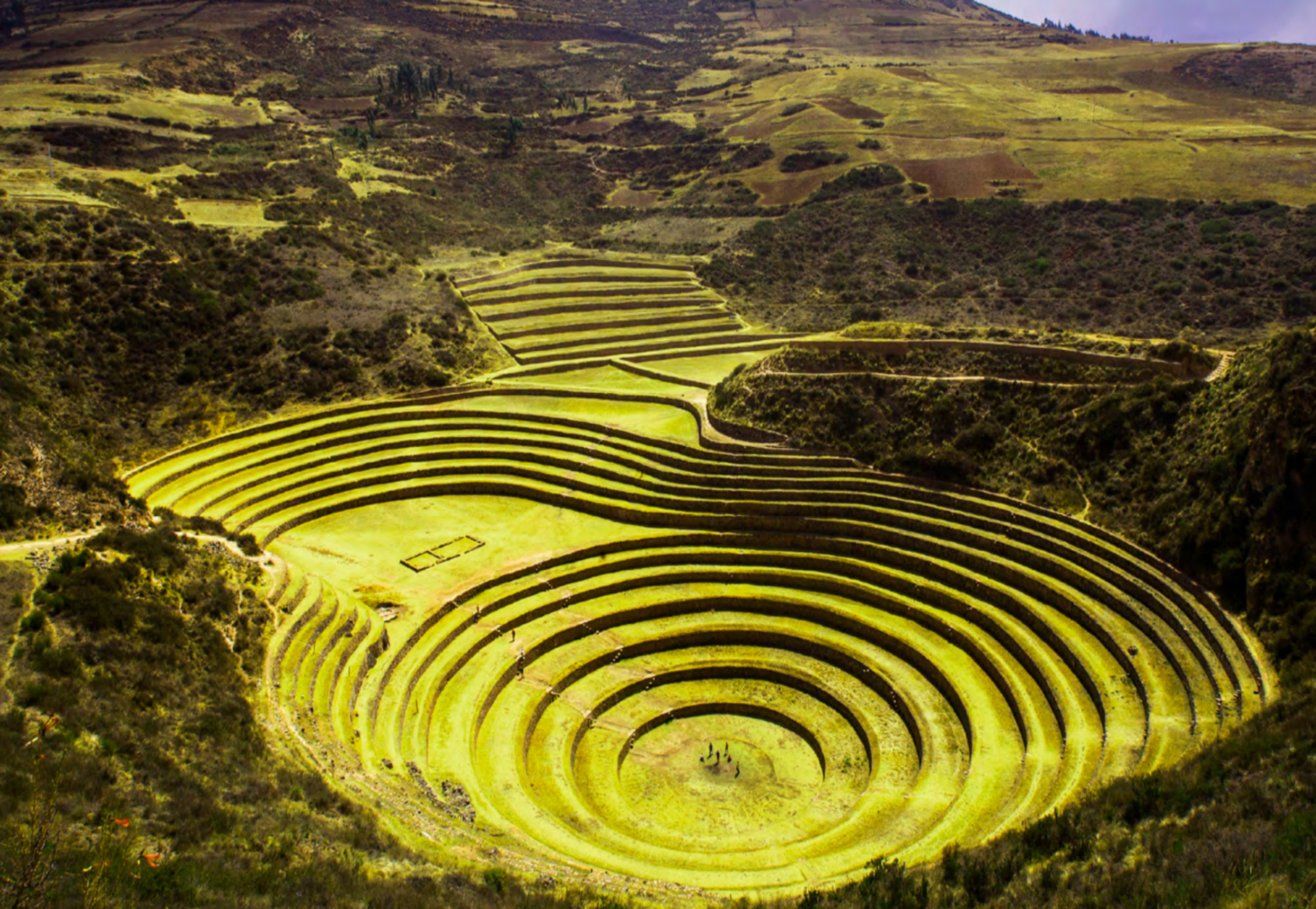
Sol y Luna – Excursion to Muray Archeological Site