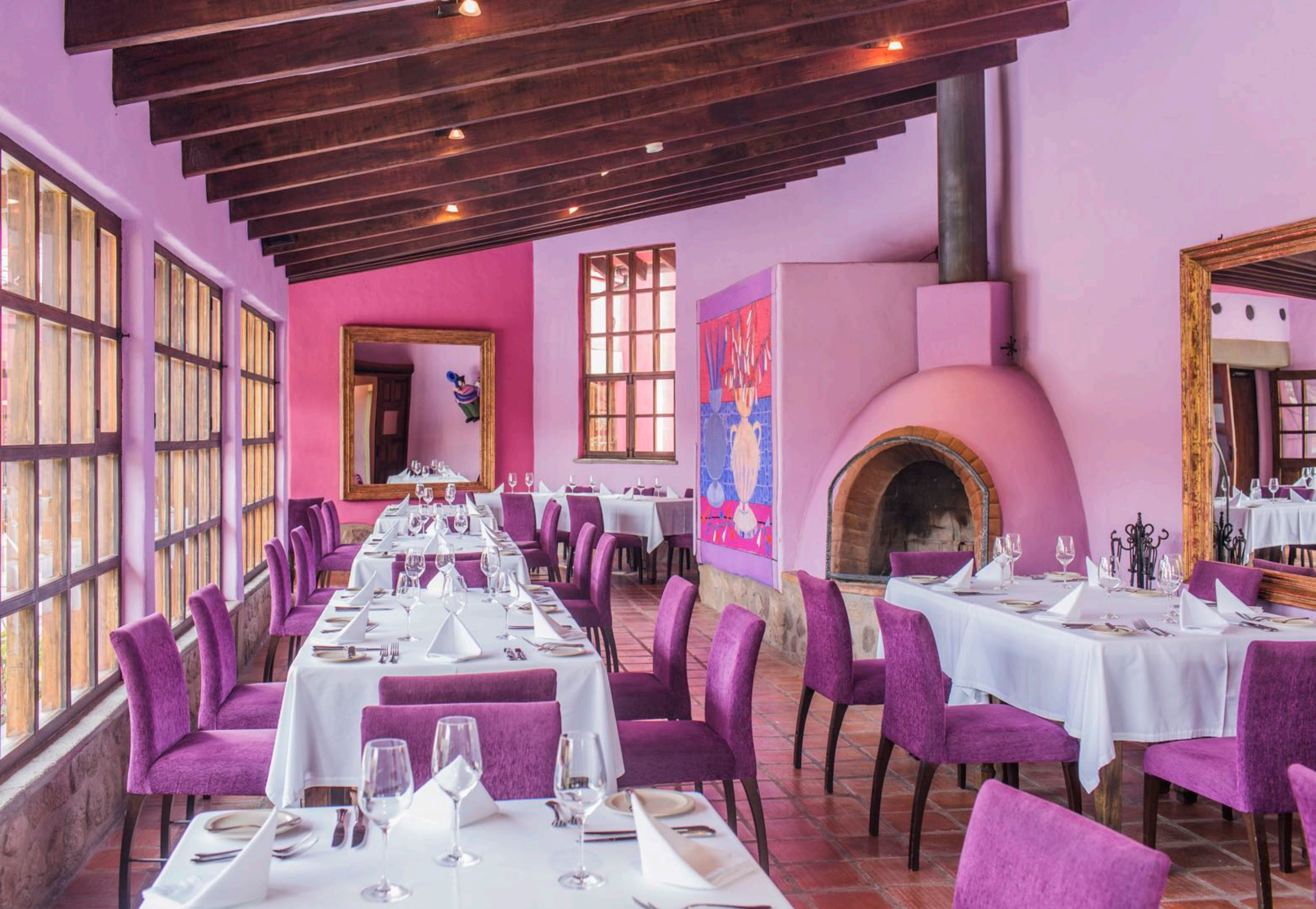
Sol y Luna – Killa Wasi Restaurant with Peruvian fine dining